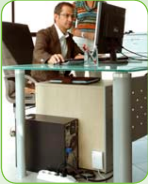
Computer and associated peripherals

Computer and associated peripherals such as printer, scanner, fax, monitor; coffee and water vending machines; water distributor machine; air conditioning; lights and anything that plugs into a wall socket.