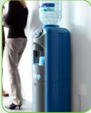
Water distributor machine