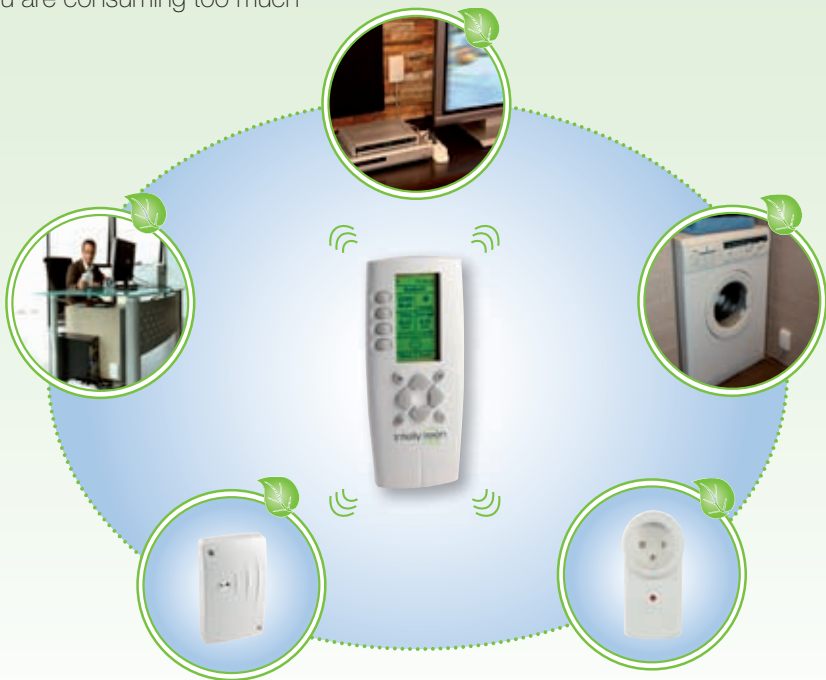
Example of functioning of IntellyGreen System