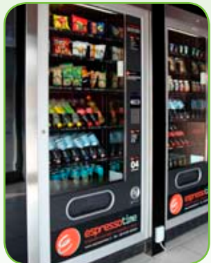
Coffee and water vending machines